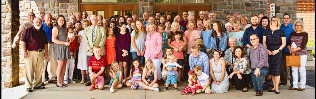
This is church.